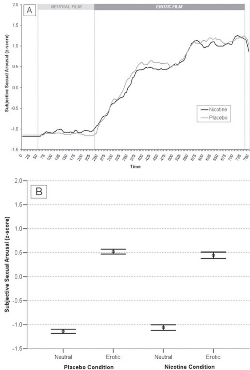
Figure 2 Subjective sexual arousal in response to drug administration. (A) Mean self-report sexual arousal in 5-second intervals across the neutral and erotic film stimuli during nicotine and placebo conditions. Data have been averaged across participants to aid in visual interpretation; however, all statistical analyses were conducted within subjects. (B) Mean self-report sexual arousal between the neutral stimulus and the erotic film stimulus during nicotine ( N = 16 ) and placebo ( N = 16 ) conditions. Open circles represent means and error bars represent standard errors of the means. Units are within-subjects standard deviations.

that changes in mood in response to drug administration did not change differentially between placebo and nicotine conditions.