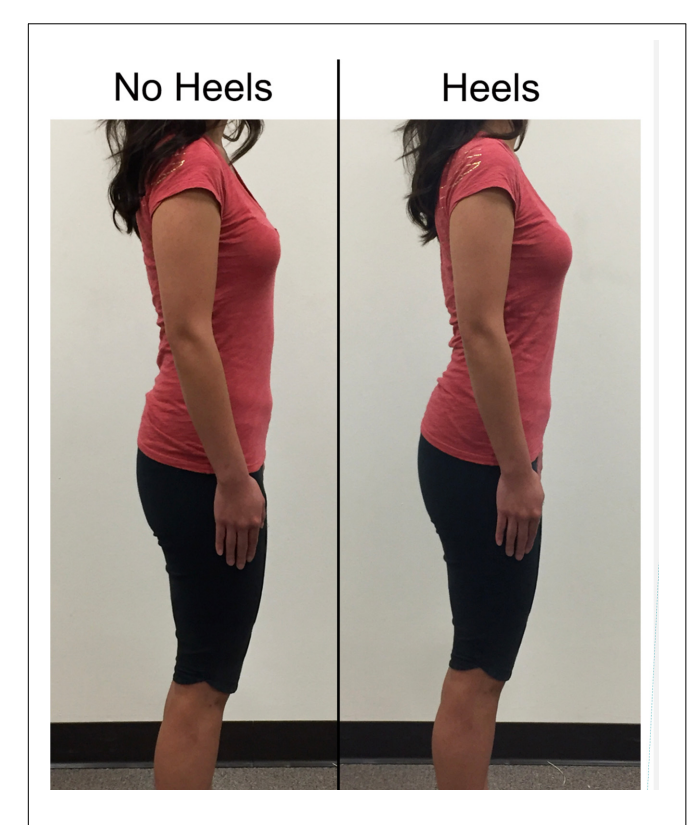
FIGURE 1 | Examples of photographic stimuli. The photographs of this woman are paired here, but all 112 study photographs – one of each of the 56 women in flats and one of each woman in heels – were presented individually and in random order, with order randomized anew for each participant.